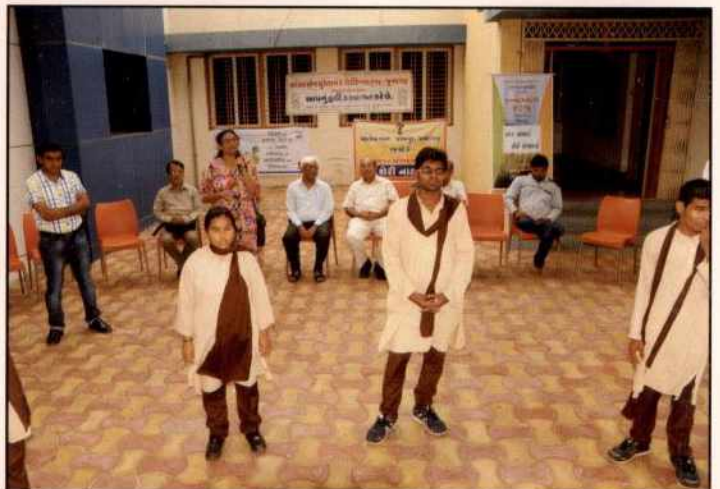
Andhajan Mandal Street Play on July 21, 2015