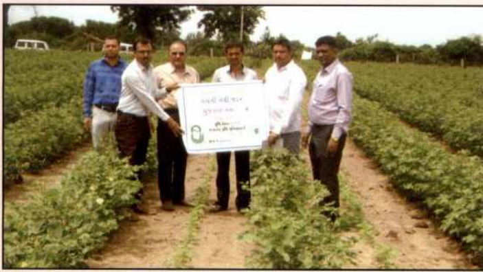
FLD at NICRA village, KVK, Amreli