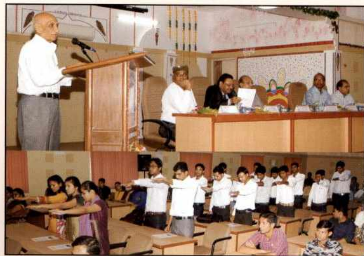
PDC distribution & valedictory ceremony