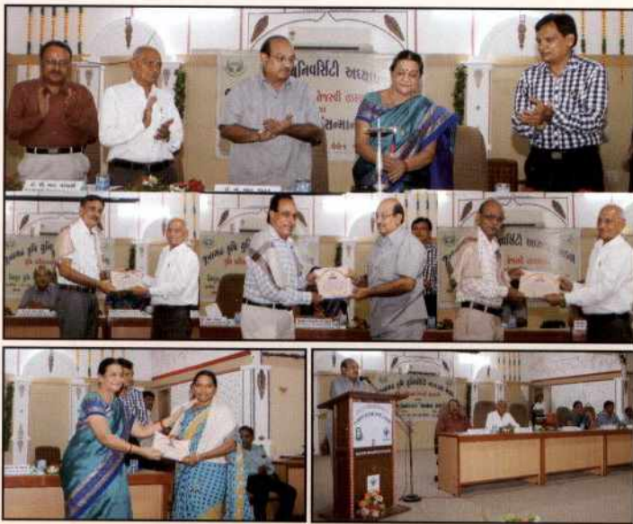
Felicitations of Rtd Scientists, Scholar children and their mothers