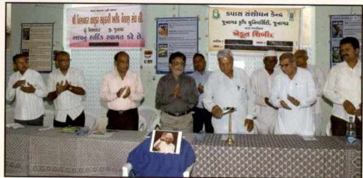
Inauguration of Khedut Shibir

Khedut Shibir at Visavadar was jointly organized with Visavadar Taluka Sales Purchase Union and Cotton Research Station, JAU, Junagadh on July 30, 2015 for the control measures of Pink bollworm in cotton. About 525 farmers participated and were benefited.