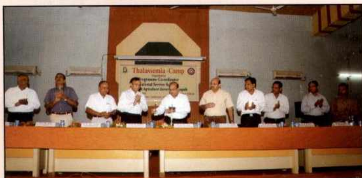
Inauguration of Thalassaemia Camp