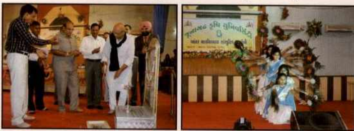
Inter Collegiate Cultural Competitions