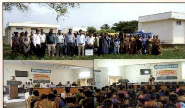
Celebration of Technology Week at KVK, Amreli.