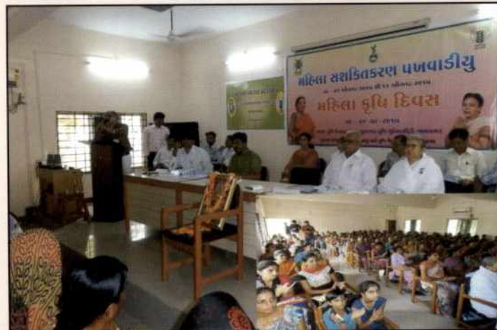
Women Empowerment Fortnight