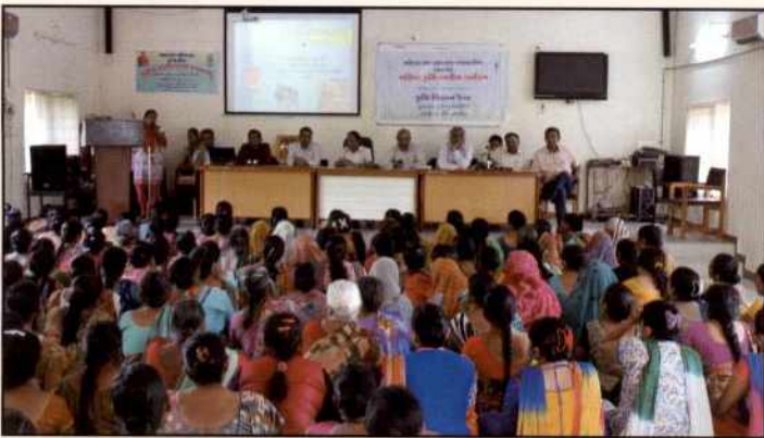
Celebration of Mahila Sashaktikaran Day at Targhadia on August 1, 2015