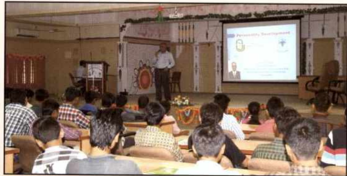
Seminar on "Personality Development"