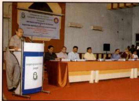
District level NSS camp

District level NSS workshop of all the four Agricultural Universities and Ayurved University of Gujarat was held at JAU, Junagadh during July 31 to August 2, 2015 as per the instructions and guidelines of Commissioner,