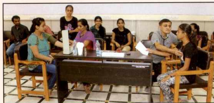
General Medical Camp for Girl Students