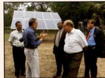
Visit of Florida Scientists to RTTC farm