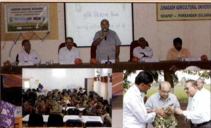
Celebration of Technology week, KVK, Khapat