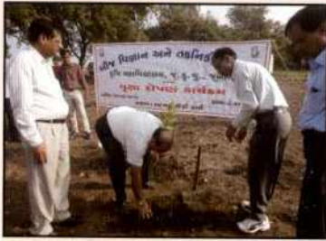
Tree plantation at Sagdividi Farm

Tree plantation programme was also organized at the Sagdividi Farm of the Department of Seed Science and Technology, JAU, Junagadh in the auspicious presence of