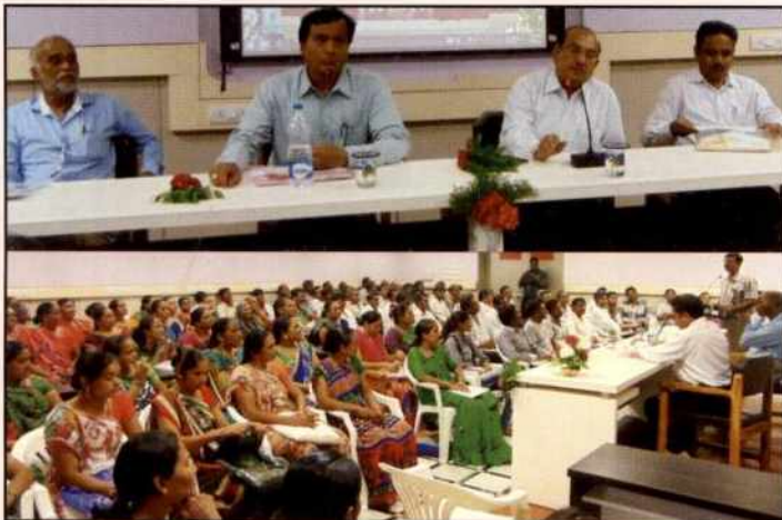
Farmers training on “Jamin ni agatyataa.... bandharan”