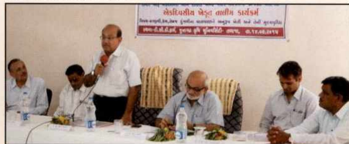
Inauguration of Farmers' Training on Climate Resilient Agriculture of Groundnut, Banana and Onion and its Value Addition