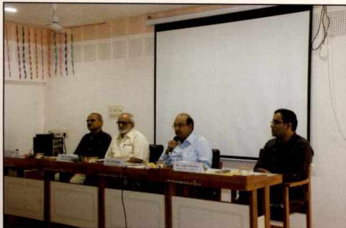
Entrepreneurship Orientation Seminar