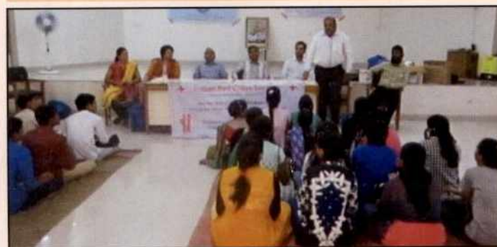
Thalassaemia Camp at Polytechnic in Home Science, JAU, Amreli