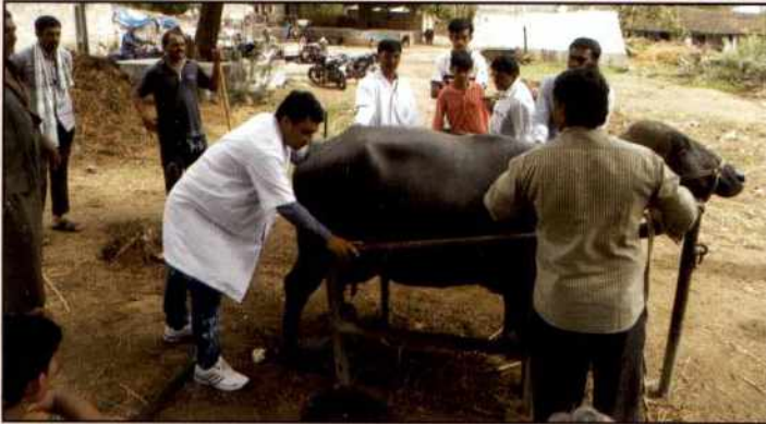
Animal camp, KVK, Pipalia