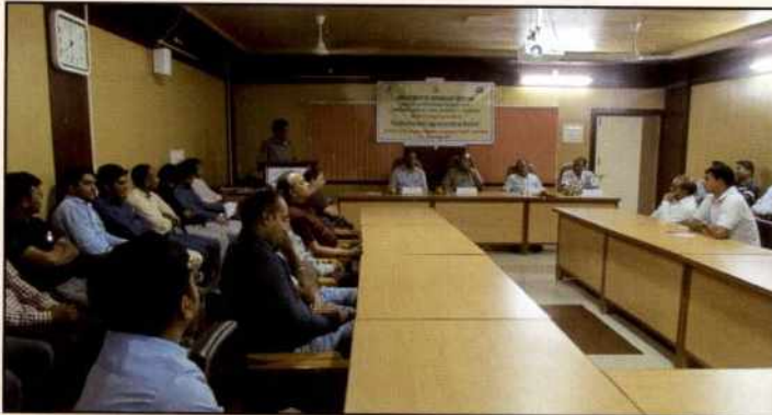
ASCAD training programmes