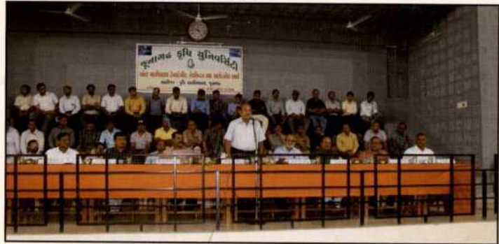
Inauguration of Inter Collegiate Basket ball, Badminton & Table tennis tournaments