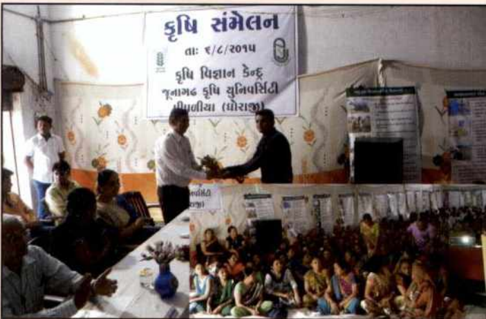
Agri seminar, KVK, Pipalia