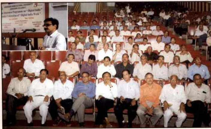
Celebration of Digital India Week