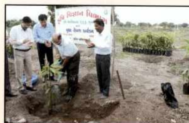
Tree plantation at Seed Farm, Agronomy