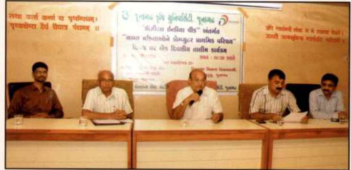
Inauguration of "Computer training to rural women" under Digital India Week Celebration at JAU, Junagadh on July 6, 2015