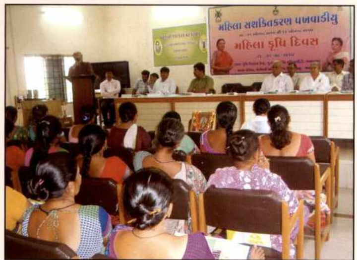
Celebration of Mahila Sashaktikaran Fortnight at KVK, Jamnagar