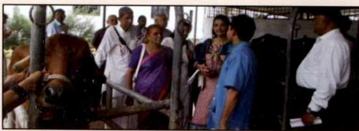
Special Clinical camp at CoVS & AH