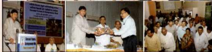
Inauguration of Coconut Farmers' and Entrepreneurs' Meet