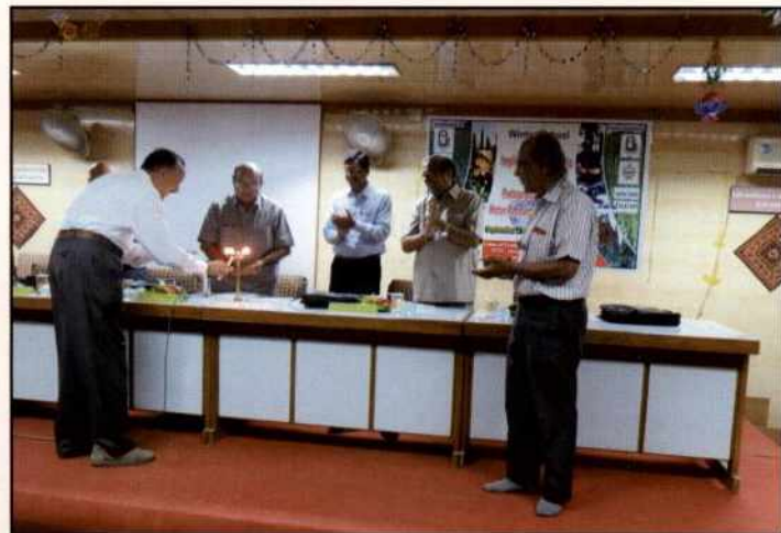
Inauguration of Winter School

A Winter School was organized by Centre of Excellence on Soil & Water Management, RTTC, JAU, Junagadh in collaboration with Central Ground Water Board, Ahmedabad, International Water Management Institute, Anand and ICRISAT, Hyderabad on "Implications of Climatic Change on Pedagogical Issues of Water Resources