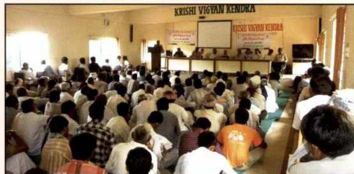
Pre-seasonal Farmers' Training at KVK, Nana Khandhasar on July 14, 2015

Technology week for the year 2015 was celebrated at Various KVKs ( Ameli : September 14-16; Jamnagar : September 28 –October 10; Khapat : September 21-25; Nana Khandhasar : September 8-12; Pipalia September 22-26; Targhadia : September 7-11) with a view to creating mass awareness among the farmers about the location specific advanced technologies for the sustainable agricultural production. Seminars and demonstrations on advanced technologies in agriculture and allied discipline were also organized by which a large number of Farmers and farm-Women from various villages of Saurashtra were benefitted.