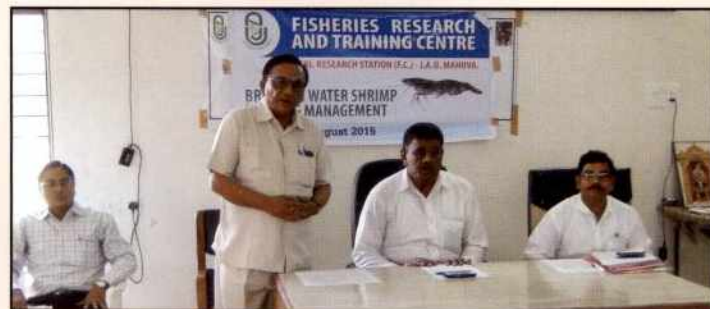
Training on “Brackish Water Shrimp Farming Management”

Five days 4 th training was imparted on “Brackish Water Shrimp Farming Management” by Agricultural Research Station (Fruit Crops), JAU, Mahuva from August 24-28, 2015, wherein 30 participants were benefitted. Total 18 lectures were delivered by the subject matter specialists. At the end, five participants gave their feedback on the training programme and expressed their satisfaction on the knowledge gained from the training.