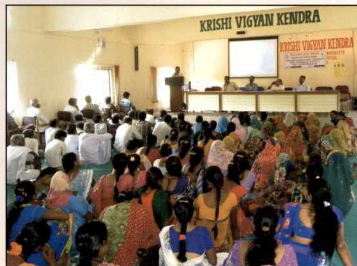
Celebration of Technology Week at KVK, Nana Khandhasar