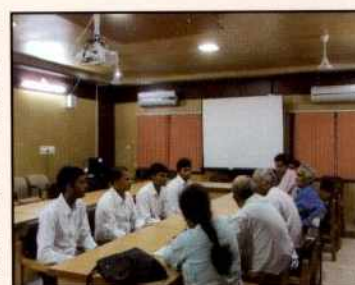
Student counseling at CoVS&AH

The Counseling & Placement Cell of the CoVS&AH, JAU, Junagadh organized campus interviews on July 23, 2015 for outgoing B.V. Sc. & A. H. batch-2015 including PG students of college. As a part of students' counseling and placement, five on-campus and three off-campus